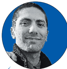
Nev Schulman Star of CATFISH I was at the City Ballet when Sara Mearns did the last movement of The Brahms-Schoenberg Quartet. She was magnificent; I was totally on the edge of my seat. And maybe in the last 36 counts, she rolled over her ankle and you knew she had hurt herself. But she finished as strongly as she started. It blew me away!