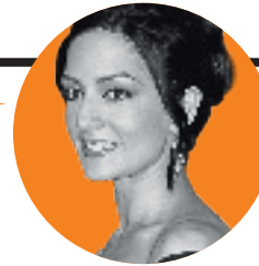
Archie Punjabi Actress, THE GOOD WIFE Eastbound & Down. It's ridiculously funny, and it's not something I would expect to find funny.