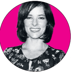
Parker Posey Actress Michelle Williams and Ryan Gosling in Blue Valentine . They are such emotionally intelligent actors. I hope more directors allow for this kind of intense collaboration. I wish I could've been a neighbor of theirs to snap them out of their destructive behavior. I could've brought over some herbal tea.