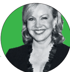
Susan Stroman Director and Choreographer, THE SCOTTSBORO BOYS "Abstract Expressionist New York" at MoMA. Artists like Rothko, de Kooning, Pollock, and Krasner were reinventing art and challenging the masters. One only hopes to be that brave and innovative with his or her own art form.