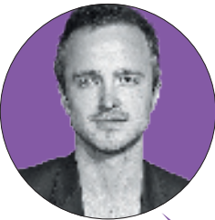
Aaron Paul Actor, BREAKING BAD The Walking Dead on AMC. Absolutely addicted to it. And the finale of Lost . Damon Lindelof, Carlton Cuse, and J.J. Abrams and the actors created a world that consumed me. Absolutely the end of an era.