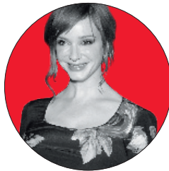
Christina Hendricks Actress, MAD MEN Bloody Bloody Andrew Jackson.

It was just sort of ... an orgy of sensory overload. It was so unexpected—I'm still reeling from it.