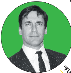
Jon Hamm Actor, MAD MEN I'm a big fan of that Cee Lo song. Can you even print the name of it?