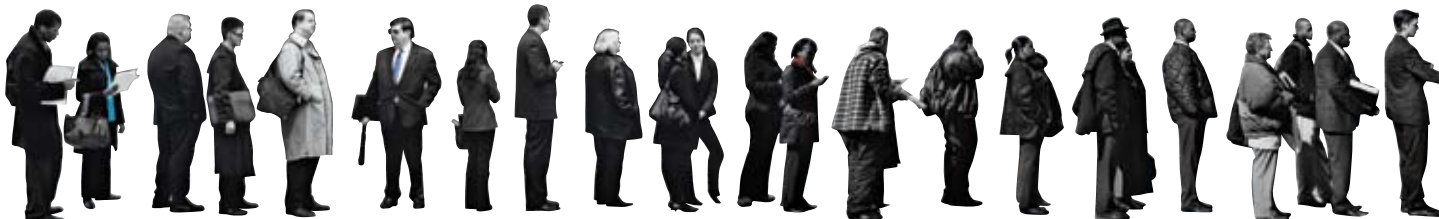
BREAKDOWN OF THE TOP-TEN JOB TYPES POSTED ON CRAIGSLIST NEW YORK FOR THE PAST FOUR WEEKS

"Sales associates," Banana Republic (part time); "Nightlife table hosting and promotions, get paid to party! Seriously!!! (Chelsea)"; "Baker needed for new upscale cake boutique ... must be skilled in baking with local, organic, and upscale ingredients and in the art of cake decoration (smoothing and piping buttercream, string work, Swiss dots, etc.);" "Chairman of highly successful, multi-billion-dollar financial firm seeks exceptionally capable individual ... to oversee his and his family's financial affairs."